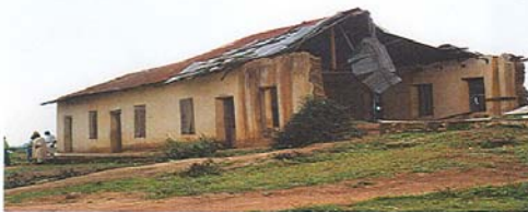
Another Example of Schools In Deplorable Conditions, which is not Conducive to Effective Learning