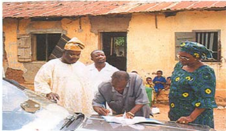
One Elementary School Principal requesting complete rehabilitation of his school building