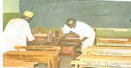
July 2004: Distributed Desks and Chairs to 12 Different Local Government Elementary Schools in Osun State, Nigeria