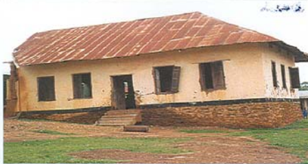
The Current Condition of Most School Buildings In Osun State, Nigeria