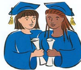
Awards Annual Scholarship to 20 Students in Osun State, Nigeria